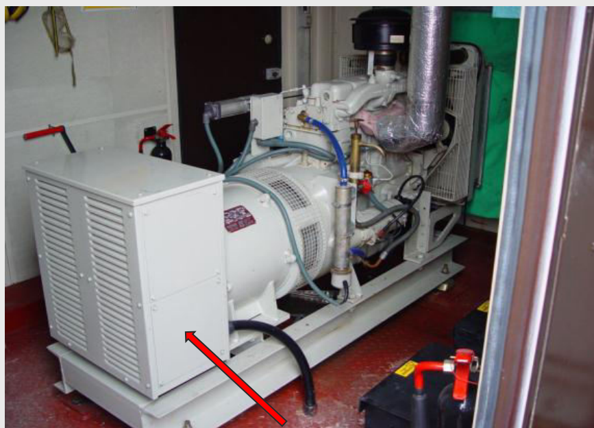
Diesel Alternator Sets